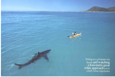
Sitting in a 3.8-metre sea kayak and watching a four-metre great white approach you is a fairly rare experience.